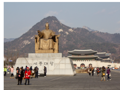
Gwanghwamun Plaza - last month 1.5 million Koreans gathered here for a massive protest

As the United States concluded a difficult election cycle, Korea entered a season of political turmoil. Though the country has a "democratic" form of government, many Koreans have long suspected corruption at the highest levels of political power. Recently, the president of South Korea (Park Geun-hye / 박근혜 대통령님) has been implicated in an egregious scandal. Evidence shows President Park's direct involvement in criminal wrongdoing including embezzlement and influence peddling. In spite of government attempts to downplay the situation, President Park currently has a public approval rating of only 4%. The people of South Korea are disgusted by their president and the state of current affairs. Several massive protest rallies across the country have occurred. The largest one was held on November 26th in Seoul where 1,500,000