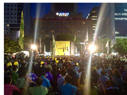
We witnessed an antigovernment protest on a visit to Busan