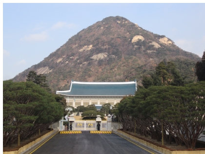
The Blue House (office and official residence of South Korea's president)

As we enter the final month of 2016, our hearts are full as we think of all that the Lord has done this year. We are sincerely grateful to our Lord for His guidance and blessings. This last month of deputation has been especially profitable as we have now reached 60% of our needed monthly support! Words cannot express the gratitude we have to our supporting churches. We are honored to partner with you for the purpose of the Gospel going forth in Korea. Thank you so much for your continued prayer and support!