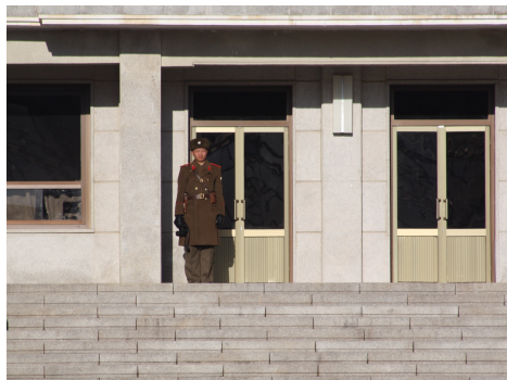
A North Korean soldier stands guard at the Joint Security Area (JSA).

As we enter the Autumn season, we hope you are enjoying the grace and blessings of our Lord. This past month was a very profitable month of deputation. We safely traveled many miles and had the privilege to present our burden for Korea to churches located in Alabama, Ohio, Indiana, South Carolina, and Virginia. We are so happy to be busy in the Lord's will. Our current monthly support level is 53%!