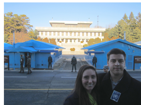
We visited the JSA inside the DMZ. This is the only place where soldiers from both sides stand face-to-face.

South Korea's neighbor to the north, The Democratic People's Republic of Korea (DPRK), has been a source of concern recently. The rogue state detonated a twenty-five kiloton nuclear bomb on September 9, 2016. This was the largest nuclear test by the North and the latest in a string of serious provocations. The communist government claimed that the bomb was designed to be delivered by ballistic missile. For South Koreans this latest incident is troubling but not surprising. Tensions between the two nations have been high since the ceasefire agreement in 1953. Technically, the North and South remain in a state of war. This fact is most evident at the Demilitarized Zone (DMZ), the buffer zone between the two countries. A great number of troops and military assets are positioned on both sides. We were able to visit the DMZ on three occasions during our time in Korea. Each visit was interesting, but also disturbing as we realized the severity of the conflict. If a full-scale war occurred again, the U.S. backed South would most likely win; however, there would probably be hundreds of thousands of South Korean casualties.