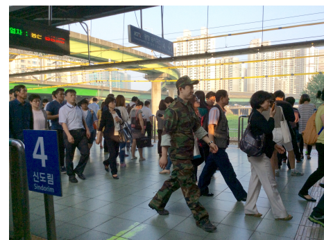
There are throngs of people in South Korea that need to hear the biblical Gospel.